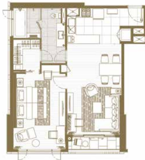
THE PILLARS EXECUTIVE EXECUTIVE ONE BEDROOM RESIDENCES 71 sqm 16 residences