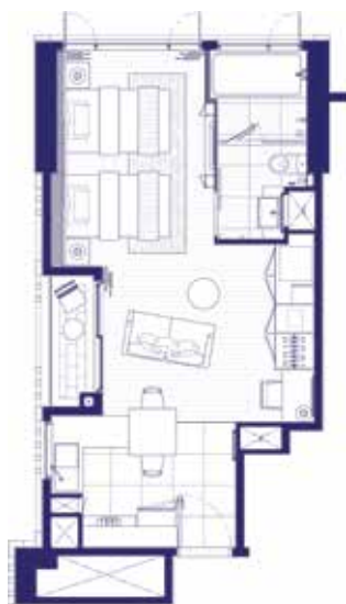
THE PILLARS EXECUTIVE STUDIO RESIDENCES 40-45 sqm 33 studios