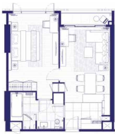
THE PILLARS ONE BEDROOM RESIDENCES 61-65 sqm 113 one bedroom residences