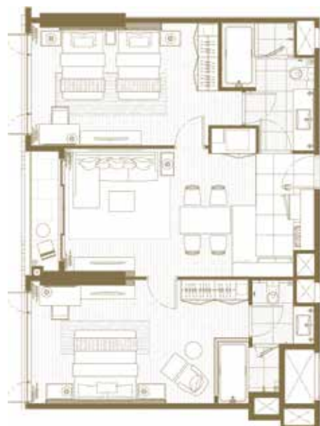
THE PILLARS EXECUTIVE EXECUTIVE TWO BEDROOM RESIDENCES 91 sqm 17 residences